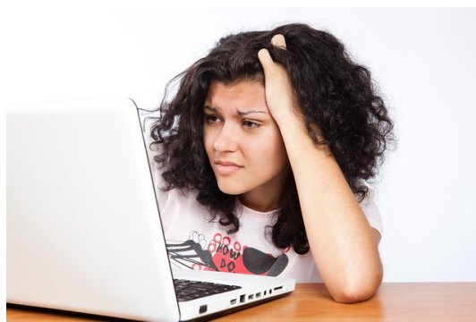
Figure 1. A student overwhelmed with her studies. [1]

Learning math is similar to learning a foreign language; it requires knowing how to speak, read, and write the "language" fluently to communicate and understand the concepts effectively. Learning new ideas can be complex and challenging, but this is essential for learning to take place. Educators often refer to this struggle as a productive struggle or a desirable difficulty .